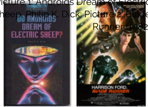
Picture 1: Do Androids Dream of Electric Sheep , Philip K. Dick; Picture 2: Blade Runner (1982)

Astronaut Dave, floating outside the spaceship: "Open the pod bay doors, HAL."